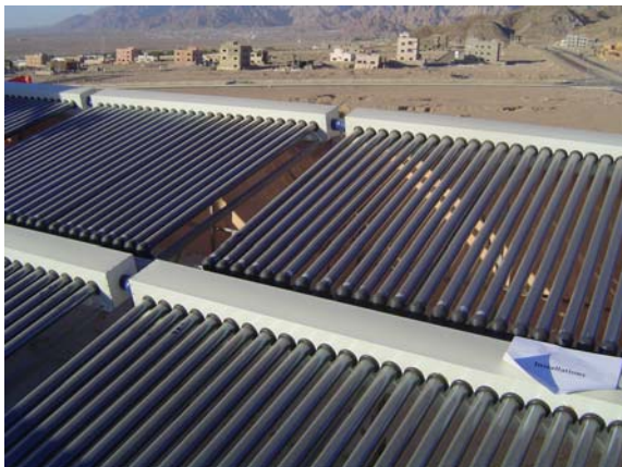
Vacuum solar collectors for solar cooling