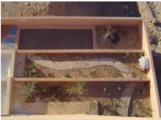
Grey-water tank and planned water treatment (plants still to be introduced in the gravel bed)