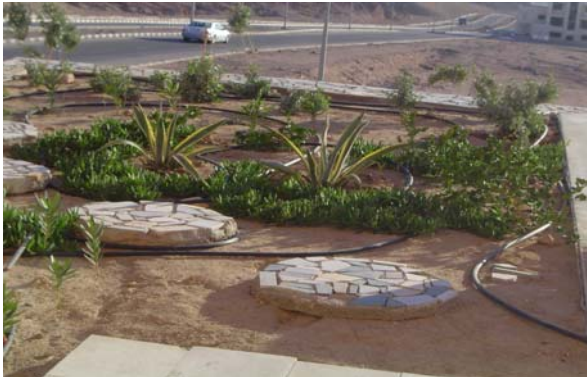
Roof garden with grey-water drop-watering