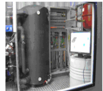
Interior view with control unit