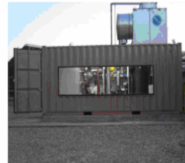
EnergyCabin ECool with cooling tower mounted on top